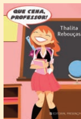
COVERS IN PORTUGAL